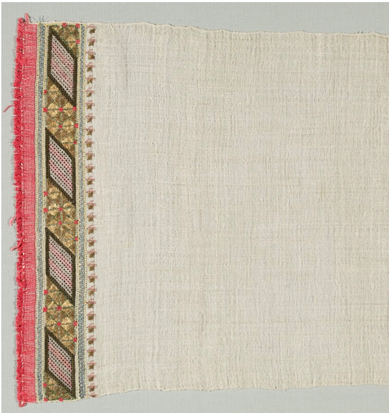
Embroidered Towel from Peshkir, 19th century

From their ancient origins to their modern-day utility, tea towels have stood the test of time as indispensable kitchen companions. Their journey through